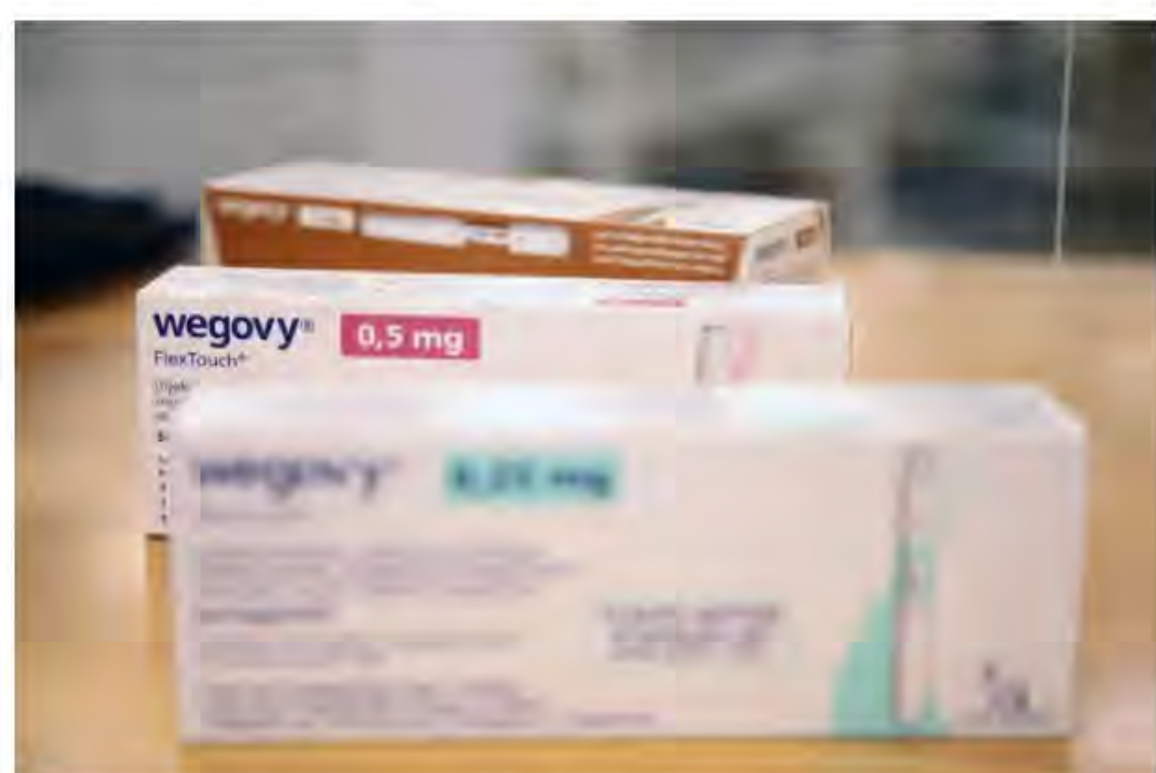
Only one Wegovy user was hospitalized or had an urgent visit for heart failure, compared with 12 in the placebo group.

Share Bookmark AA 79 Gift unlocked article Listen (4 min)